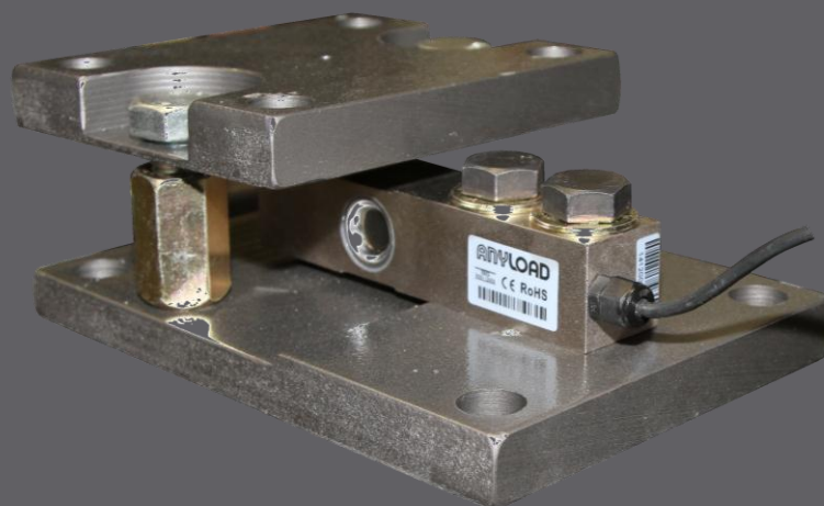
Shows an ASAM Weigh Module with 5t 563YH Load Cell

Associated Scale Service Pty Ltd Ph: +61 (0)7 3272 0077 Email: info@associatedscales.com.au Web: www.associatedscales.com.au